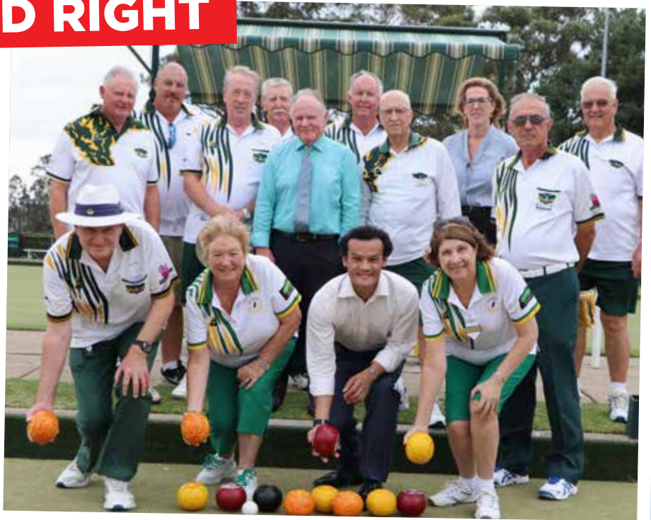
Ingleburn Bowling Club is grateful for its CBP grant used to build new sun shades.

To find out more about this terrific program please call my office or visit communitybuildingpartnership.nsw.gov.au